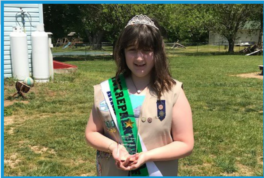
Harford County Top Seller earns title of Entrepreneur of the Year