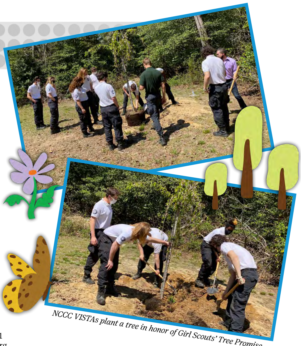
NCCC VISTAs plant a tree in honor of Girl Scouts' Tree Promise