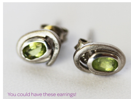
You could have these earrings!

To go to the auction, use the link on the gscm.org homepage