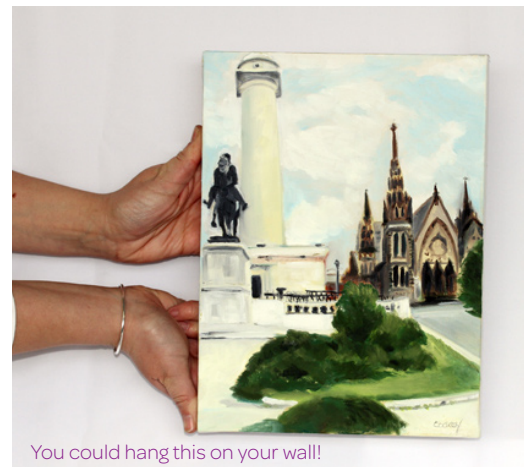
You could hang this on your wall!