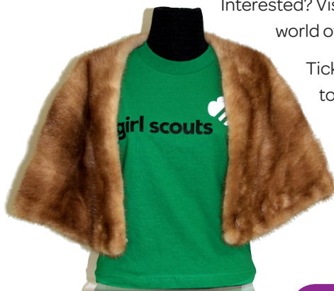
You could be the most stylish person at Camp Conowingo!