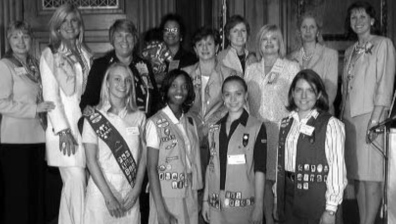
2005 DW Honorees and Shadow girls with event co-chairs and GSCM CEO and President.