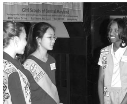
2005 DW Shadow girls (above) Former DW Honorees (below)