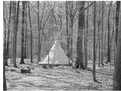
TIPI & LOG CABIN Laughing Water

Camp Conowingo is 600 acres of forest and fields adjacent to the Susquehanna River in Conowingo, Cecil County, Maryland. The property is composed of nine parcels acquired by Girl Scouts of Central Maryland between 1955 and 1973, including Bell Manor, a historic Victorian home from the 1860's which is currently being renovated to return it to its original 1867 charm. Camp Conowingo is the home of Girl Scouts of Central Maryland's summer Resident Camp program.