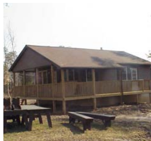
YURTS & KITCHEN SHELTER Trailing Pines