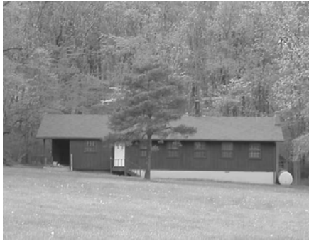
BALD EAGLE LODGE